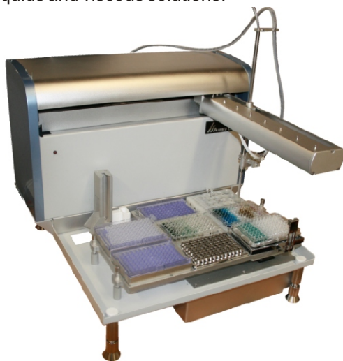
VERSA Mini Workstation

The VERSA Mini workstation supports many specifically defined test conditions and can aspirate and dispense a variety of liquids and viscous solutions.