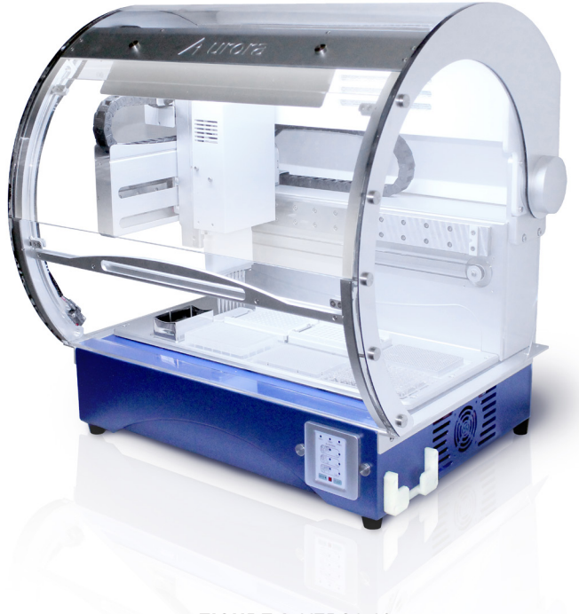
FIGURE 1. VERSA 10

Aurora's VERSA series of automated liquid handling workstations are designed to automate different extraction protocols on a user friendly software known as VERSAware. VERSA 10 covers the low to medium throughput requirements with 6 deck positions (Figure 1). Utilizing air displacement pipetting technology, it offers precise and accurate handling of various liquid volumes. This application note provides a detailed guide on how to automate the MMDNAT kit using scripts specifically designed on the VERSA 10.