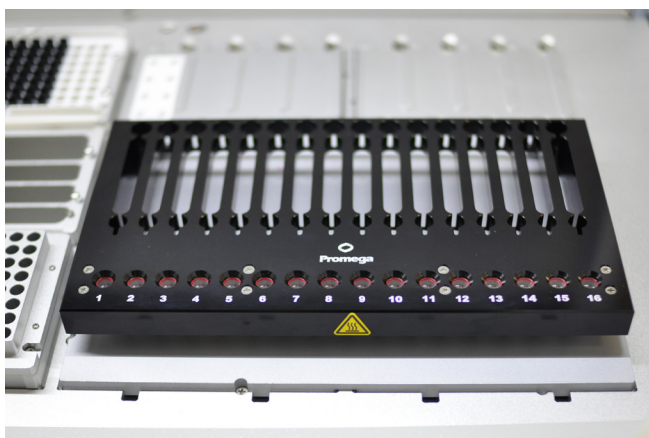
FIGURE 4. Optional: Promega Maxwell™ extraction tray insert for the deck