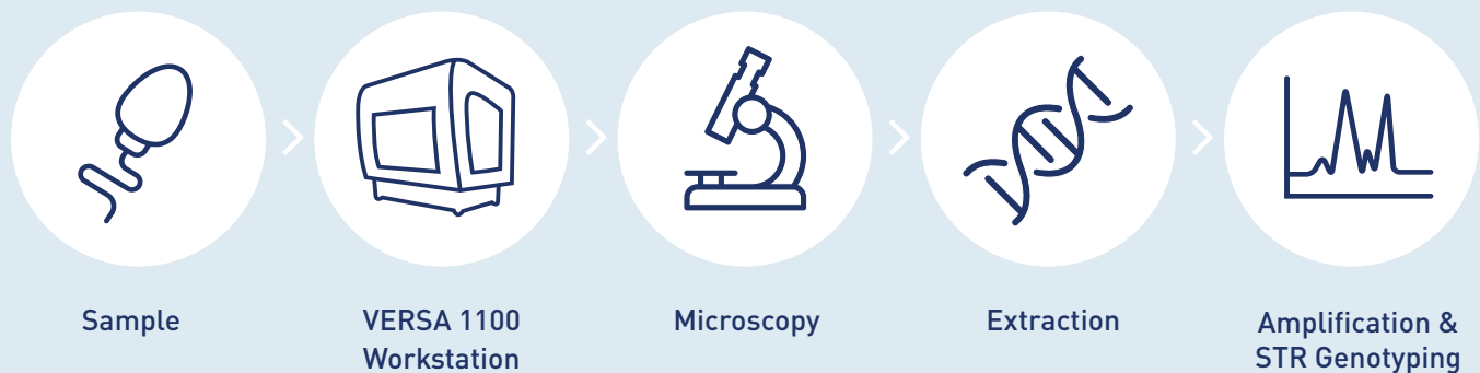
FIGURE 1. Full differential digestion workflow with automating component using VERSA 1100